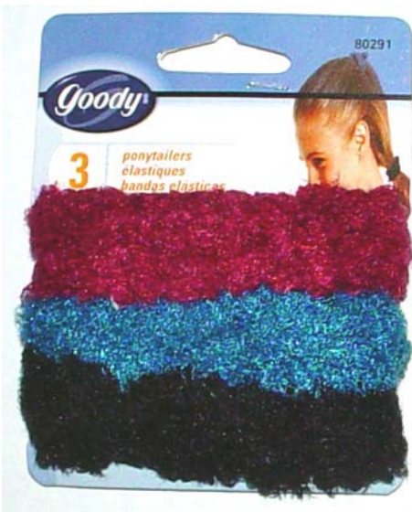
ITEM # 80291