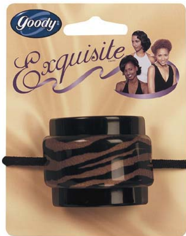
ITEM # 45603