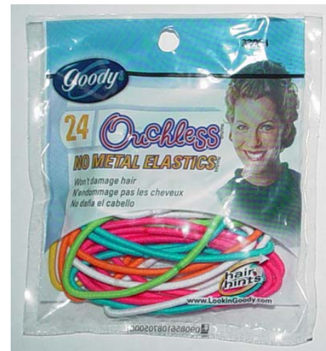
ITEM #32964 QTY: 30,384