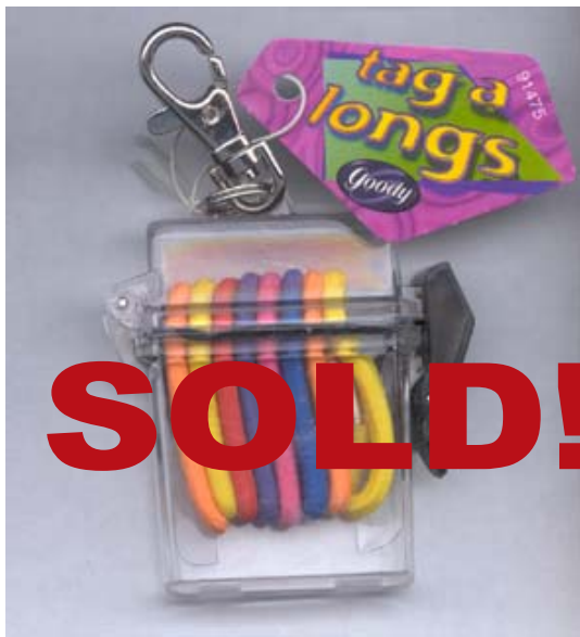
ITEM # 91475