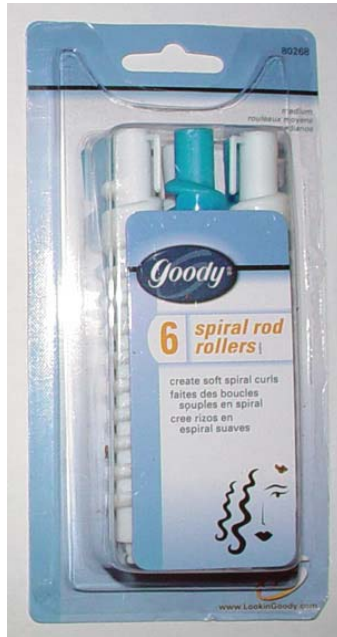
ITEM # 80268