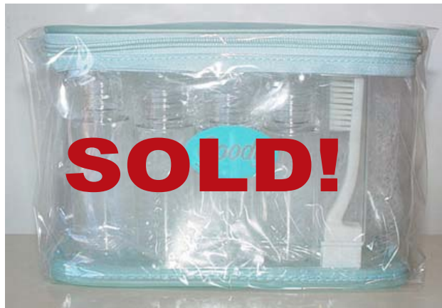
ITEM # 99416