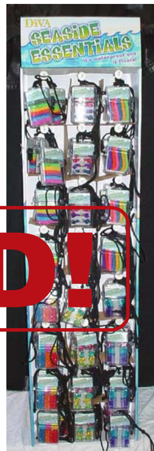
SEASIDE ESSENTIALS WITH FLOOR STAND #98203