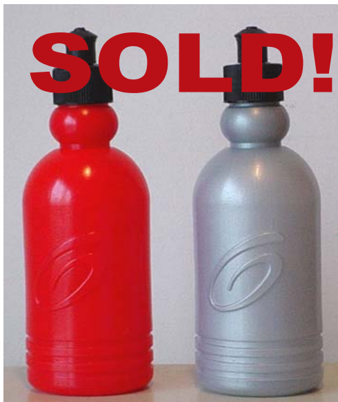
ITEM # 10505