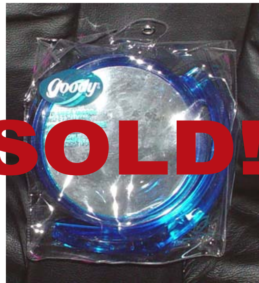
ITEM # 80373