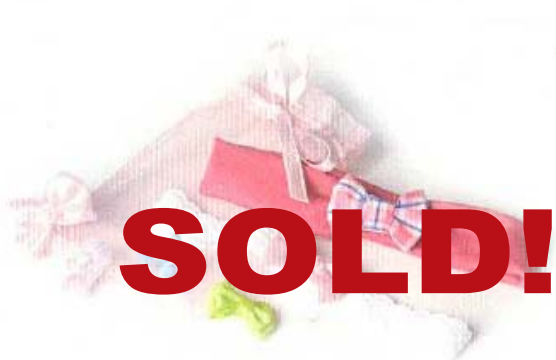
ITEM # 98477