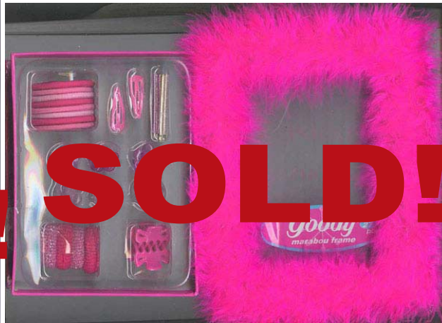
ITEM # 91665