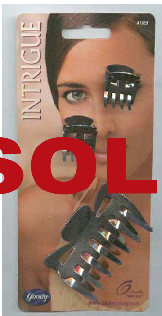
ITEM # 41533 INT SOLD