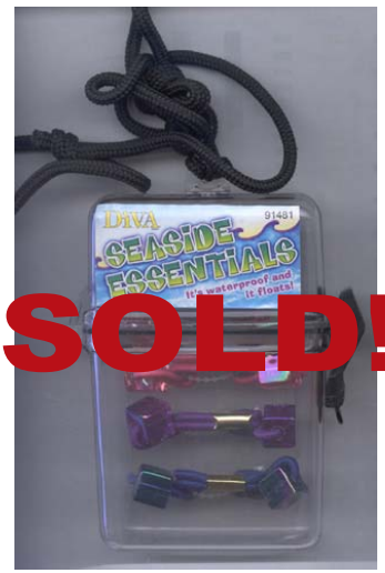
ITEM # 91481