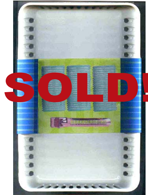
ITEM # 01632