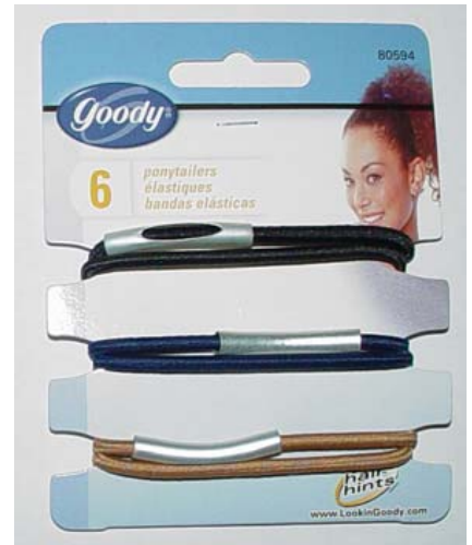
ITEM # 80594