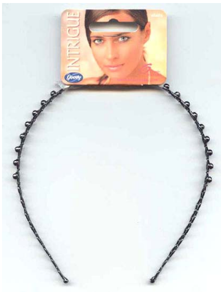
ITEM # 41424 INT