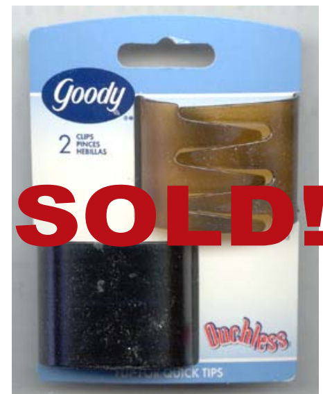
ITEM # 82813