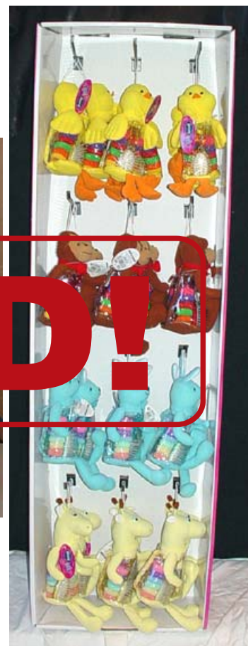
PLUSH ANIMALS WITH FLOOR STAND #98278