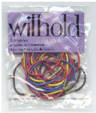
ITEM # 4501 QTY: 42,479