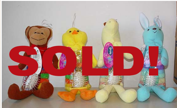
ITEM # 98278