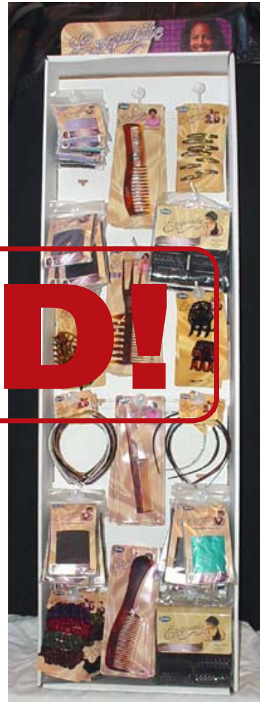
EXQUISITE HAIR ACCESSORIES WITH FLOOR DISPLAY #99131