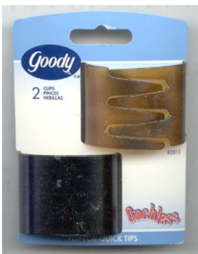
ANCHLESS HAIR ACCESSORIES WITH DISPLAY #98371