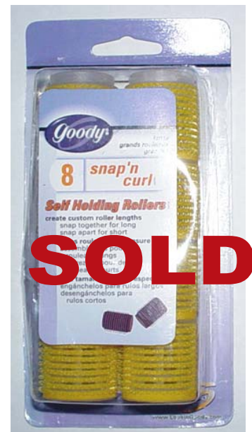
ITEM # 80246