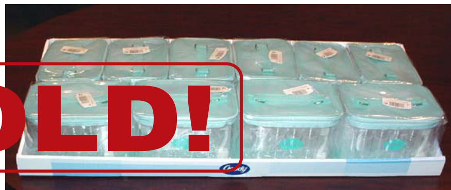
TRAIN CASE WITH SHELF DISPLAY #99416