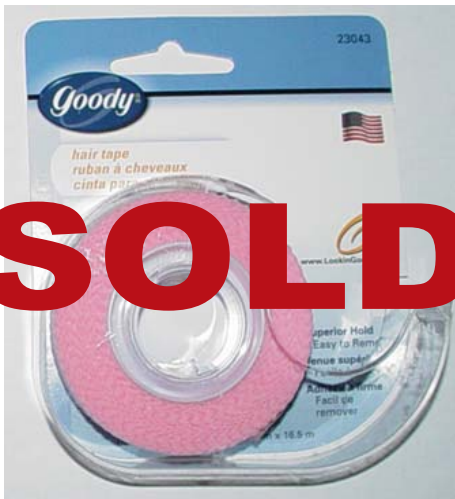
ITEM # 23043