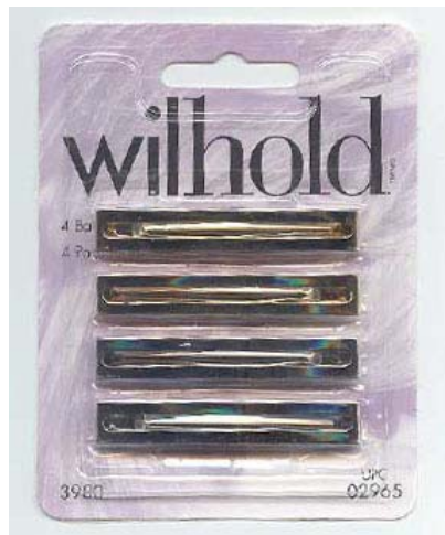
ITEM # 3980 QTY: 116,064