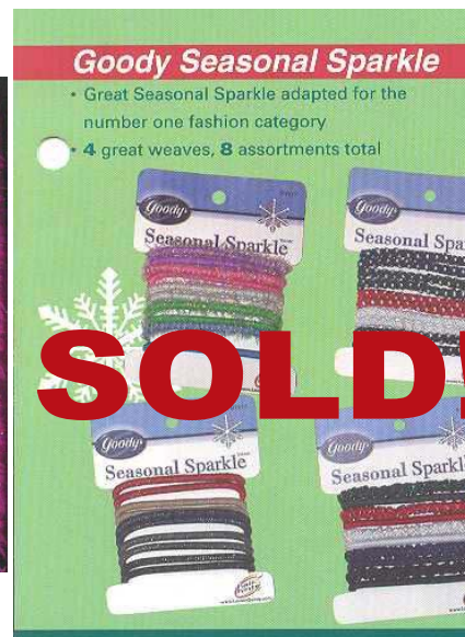
ITEM # 98229