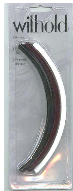
ITEM # 1764 QTY: 54,422