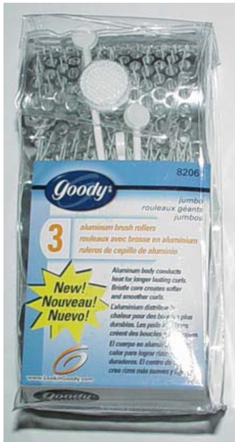
ITEM # 82061