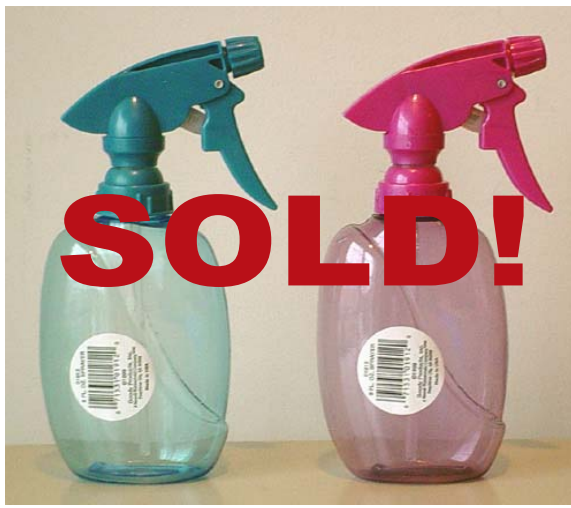
ITEM # 01912